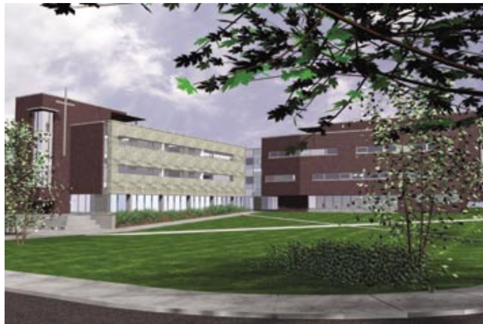
The new Father John Redmond School

Plans are also underway to build a Catholic elementary school east of Lakeshore Lodge. I am very pleased that the TCDSB has guaranteed that there will never be portable classrooms at Father John Redmond or the new elementary school site.