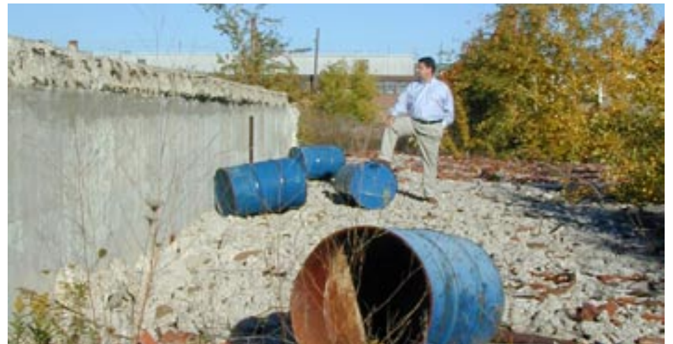
"We have to change this kind of image. These lands should be on every corporate radar as the place to build and operate businesses from."

The City of Toronto has created Toronto's first Industrial and Office Investment Grants. This is an innovative and creative approach to stimulate investment in our community. We have announced a dual grant program for the "New Toronto Employment Area". The first is the Rehabilitation Grant—this grant provides a tax grant to undertake property and building improvements and is available to a maximum of 62.5% of the total municipal share of new taxes resulting from new development. A minimum investment of $500,000 is required and the property must be utilized for eligible employment uses. The second grant available is the Façade Grant—this grant will go to redesign, renovate or restore commercial/industrial facades. It is available to a maximum of $12,500 and covers 50% of eligible costs with a minimum $5,000 investment. Remember that architectural and design fees are also eligible expenses. To qualify for either grant, the property must be located within the "New Toronto Employment Centre". If you or your company want to apply, applications are available by calling 416-394-8244 or 416-392-1005. Should you require any further information, please call my office.