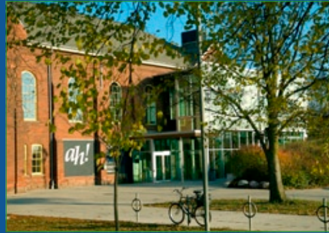
The Assembly Hall