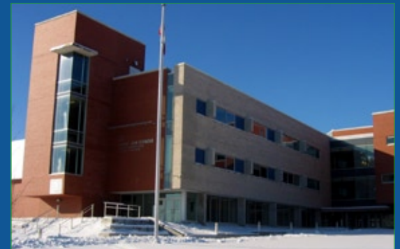
Father John Redmond Catholic Secondary School