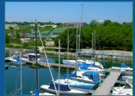
Lakeshore Yacht Club