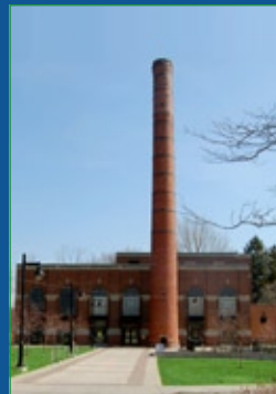
The Power House